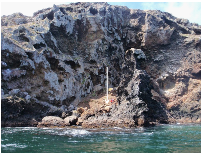
Fig. 2: Overview of Ashy Storm-Petrel nesting habitat at Portuguese Rock Cove, Anacapa Island, 6 June 2011. The white arrow indicates the location of the nest found on 27 August.

Colony size can be partially inferred from mist-netting results. Mist-netting efforts at Anacapa varied between surveys conducted in 1994 (before rat eradication) and in 2011 (afterwards), and so we did not attempt statistical comparisons (Harvey et al. 2013b, Carter et al. 2013). Yet, even given the different and relatively low survey efforts in each year, small numbers and low capture rates of ASSP were seen in both years, as well as similar percentages of birds with brood patches. These findings suggest that population size did