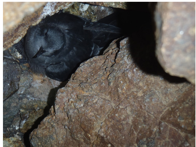
Fig. 3: Fledgling Ashy Storm-Petrel (with down feathers visible on upper abdomen) in nest crevice in Portuguese Rock Cove, Anacapa Island, 27 August 2011.