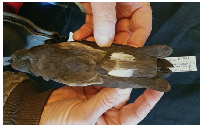
Fig. 3: Leach's Storm-Petrel (SDNMH #39942) captured by R.L. Pitman and S.M. Speich on 23 June 1976 at Prince Island, California.

Ainley (1980) and Power & Ainley (1986) reported two LESP specimens from the San Miguel Island area: SDNMH 39942 (Fig. 3) from PI in 1976 (rump score = 4) and USNM 544522 (Castle Rock; 14 May 1968; rump score = 10). USNM 544522 was later re-identified as an ASSP (see Carter et al. 2016a), and